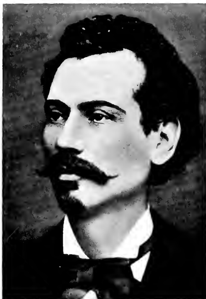
PEREZ BEN MOSHEH SMOLENSKIN